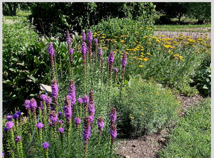
Pollinator Garden at Dawes Arboretum

COLLEGE OF FOOD, AGRICULTURAL, AND ENVIRONMENTAL SCIENCES