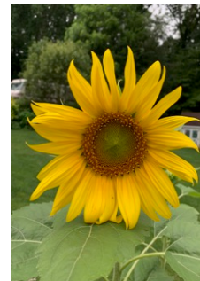
Sunflower: pride, sunshine, devotion