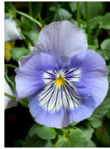
Pansy: you fill my thoughts