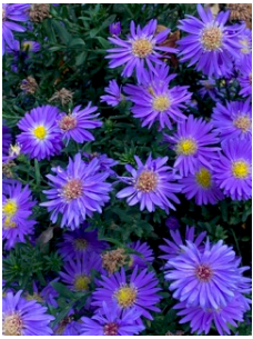
Aster: symbol of love, daintiness, contentment