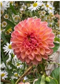
Dahlia: good taste, pomp